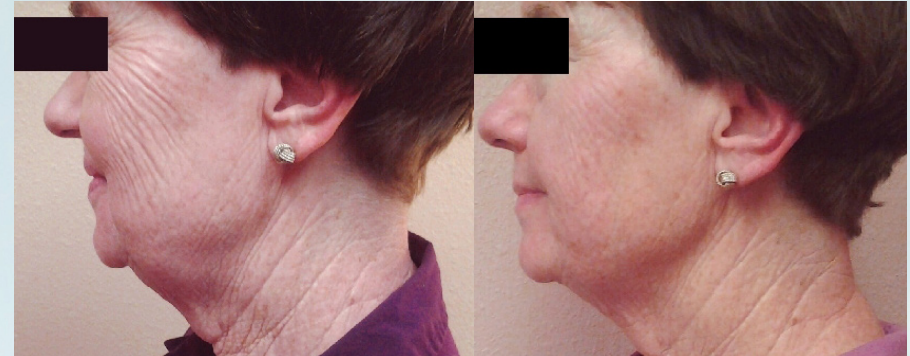
This patient (age 75) had impressive results after four 40-minute UltraSlim® skin treatments